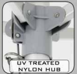
UV TREATED NYLON HUB